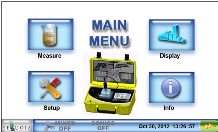
Touch panel screenshot of Main Menu