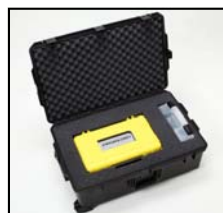
LISST-PORTABLE|XR and toolbox in ship case (included)