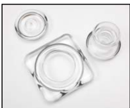
LISST-PORTABLE|XR lid and ultrasonic holder detail (all parts included)