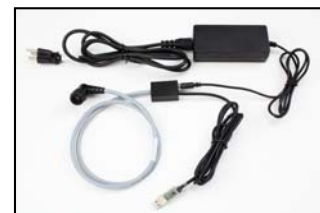
LISST-PORTABLE|XR power supply, charger and USB offload cable (included)