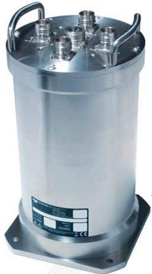
Saturn 10 Subsea

The Saturn 10 surface and subsea systems are designed to support the offshore construction and multibeam survey industries where reliability, price and performance are essential.