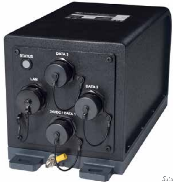
Saturn 10 Surface