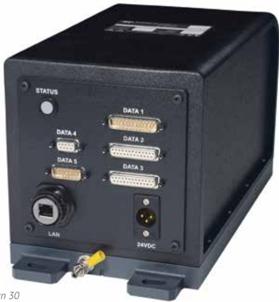
Saturn 30 Surface

The Saturn 30 Surface system is designed as a solid state attitude and heading reference system (AHRS) and primary navigation sensor. The unit has no moving parts and is maintenance free – it is also lightweight, compact and highly reliable – ideal for installations where space is at a premium. It is a flexible system for all sizes of vessel and excels on smaller craft such as fast ferries, yachts and patrol craft.