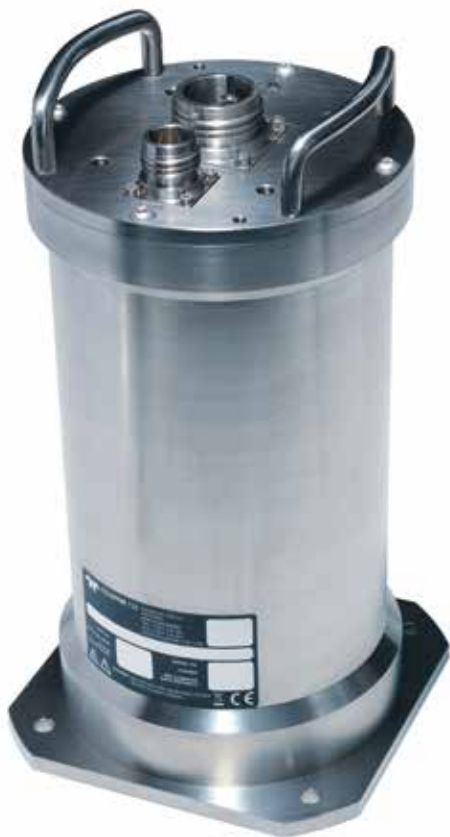
Saturn 30 Subsea

The Saturn 30 Surface system is designed as a solid state attitude and heading reference system (AHRS) and primary navigation sensor. The unit has no moving parts and is maintenance free – it is also lightweight, compact and highly reliable – ideal for installations where space is at a premium. It is a flexible system for all sizes of vessel and excels on smaller craft such as fast ferries, yachts and patrol craft.